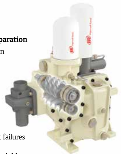
The all-in-one CE55X air end features improved air/oil separation and reliability.